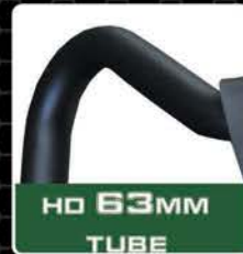
HD 63MM TUBE